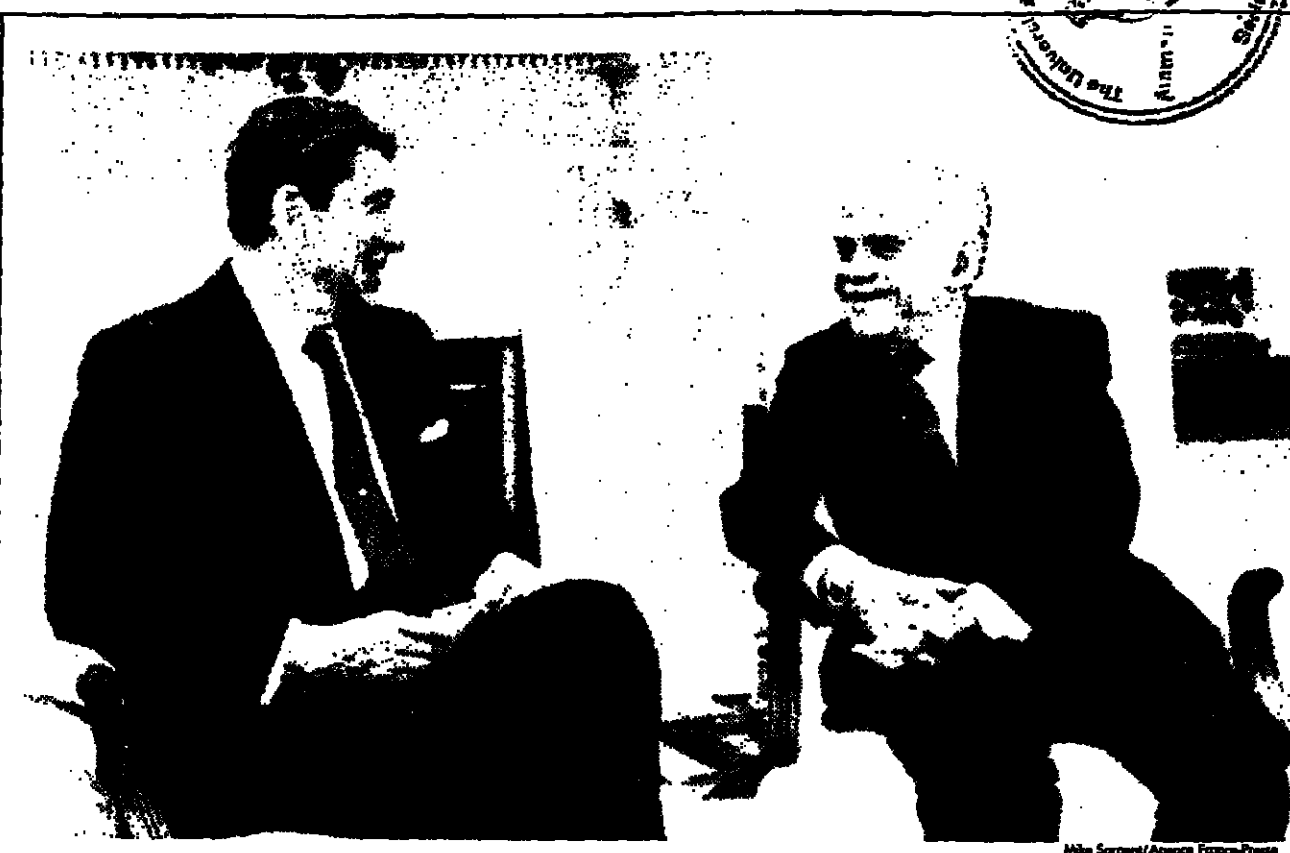
Reagan Meets With Shamir at the White House Prime Minister Yitzhak Shamir of Israel met Friday with President Ronald Reagan in Washington.

MOSCOW — Mikhail S. Gorbachev said Friday that Soviet Communists must stop issuing "strings of orders" and find new ways to lead society under the Kremlin's program for social and economic change.